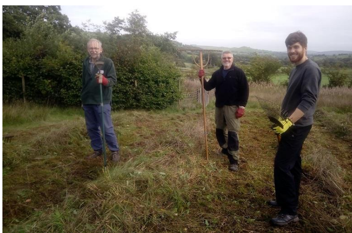
Pendle Hill volunteers haymaking at Clarion House

The links with the Pendle Hill Farmers Network continues to grow. This quarter we have worked on the following: