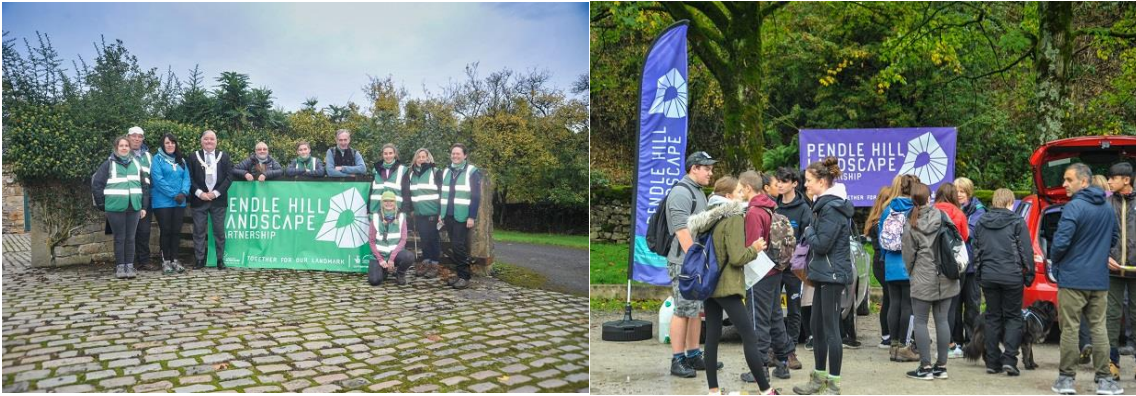
New LP Branding at the Meet You at the Top event