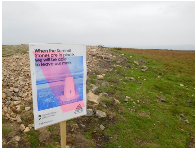
Summit signs In-Situ

https://www.instagram.com/insitu_pendle/ view The Gatherings