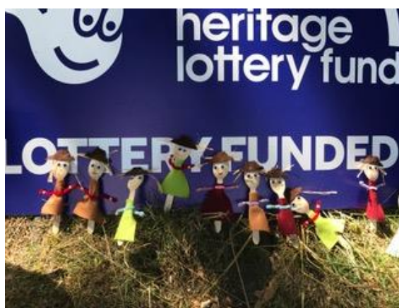
Summer Holiday family learning activity