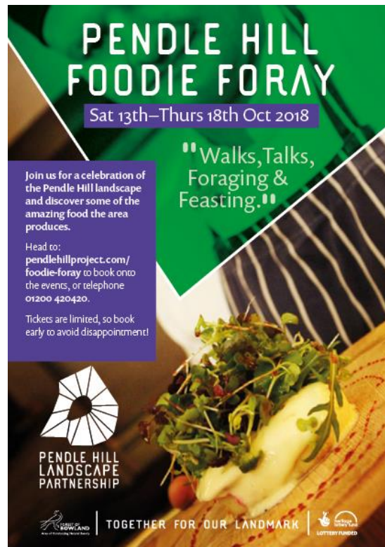
Foodie Foray poster

https://pendlehillproject.com/foodie-foray-profiles Bookings are going well, with a number already sold out. The events are being promoted by Salar Media via local press, the Scheme website and social media.