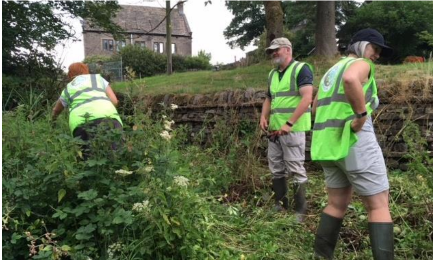
Ribble Rivers Trust volunteers removing Himalayan balsam at Barley