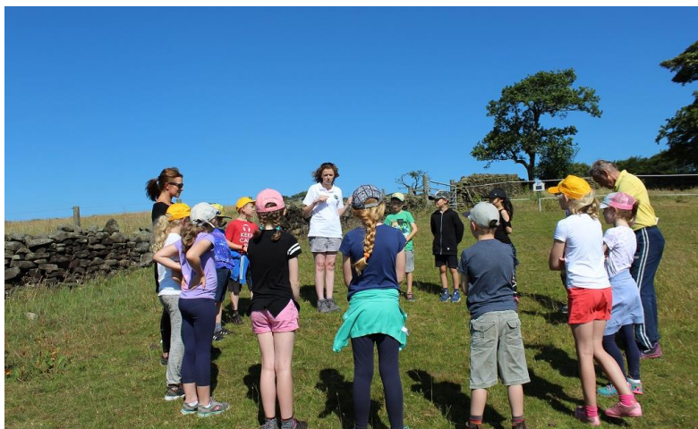
Blacko School playing archaeology games

In July, to coincide with the community archaeology project and the excavation at Malkin Tower Farm, 3 school groups were invited on educational trips. These were 13 lower KS2 (Blacko primary school) and 33 year 3/4s (Chatburn primary) to learn about Pendle Witches, 17 th C survival and archaeology. 7 college students (Burnley collage), KS5, also attended to learn about geology, geography and conservation of area, plus the Pendle witches and archaeology in action. All participants were supervised and lead by the outdoor learning officer, with the archaeology professors providing a talk and supervision of the practical archaeology task.