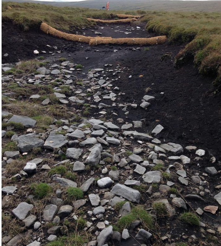
Coir logs across low wide gully