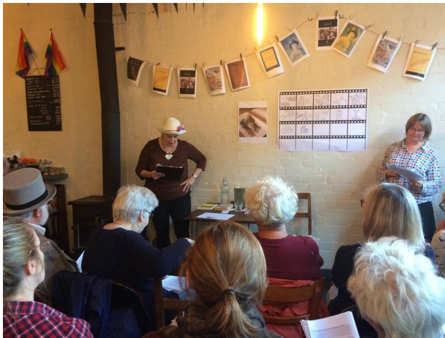
Pendle Radicals at Burnley Literature Festival: Searching for a Factory Girl

The focus during this quarter has been on building up and consolidating our core group of volunteer researchers. We are delighted with progress: two research and discussion groups have been held, plus a research visit to Lancashire Archives, each session attracting 6-8 volunteers. The volunteers have developed the first detailed enquiry, into writer Ethel Carnie Holdsworth, and two public events have been held in July and September, the second as part of Burnley Literature Festival attracting 30 people. Participants are initiating research into topics including Sydney Silverman MP, the 'radical rambler' Tom Stephenson, the force behind the creation of the Pennine Way, Selina Cooper, and the tradition of protest banners.