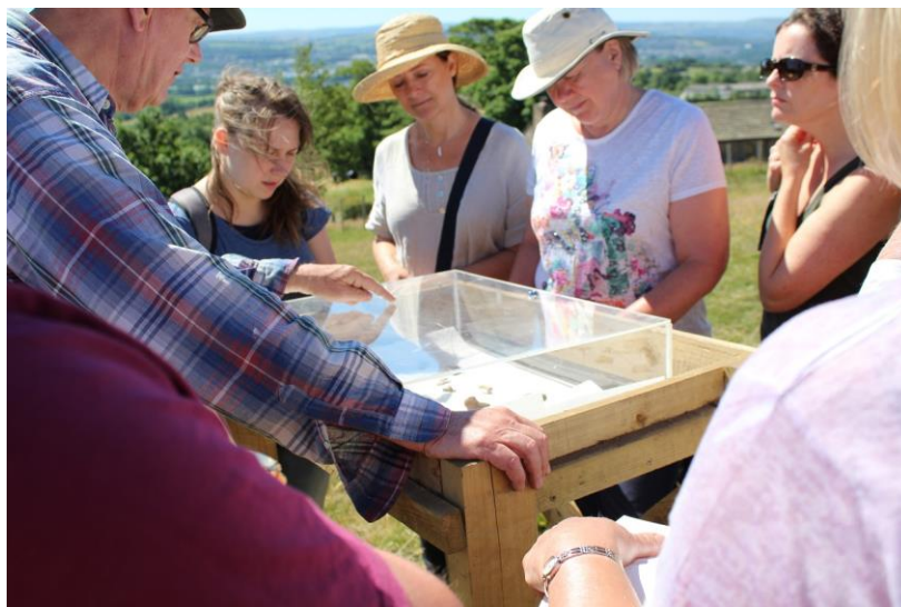
Malkin Tower community day