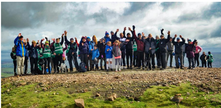
The Summit: Meet You at The Top

The Summit project was the location of our very successful public launch: 'Meet You at The Top' held on 6 th October attended by nearly 200 people – full report in Q3