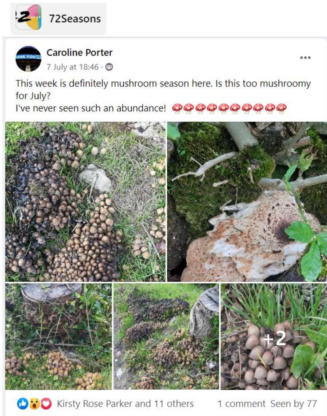
Facebook post from a 72Seasons contributor – typical of the kind of information the group shares and enjoys

Whilst the lockdown restrictions have meant we have been unable to attract as many new participants or specific mental health issue groups to engage as we had hoped, we have been looking at how we could extend the project next Spring with one or two target groups, for example BAME residents or young people.