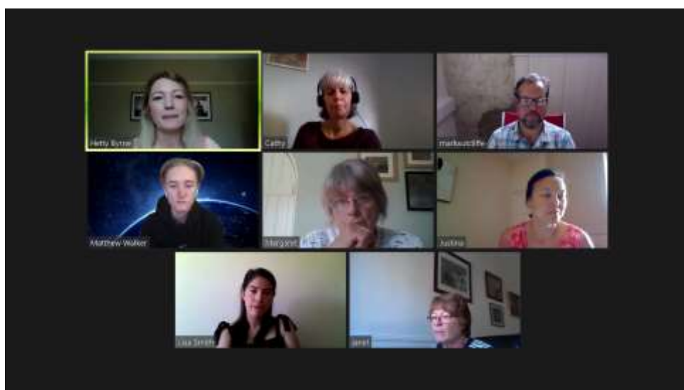
Sense of Place training webinar – in 2020 lockdown 'zoom style'

Workshop 1 – attended by 4 businesses and Workshop 2 – attended by 5 businesses.