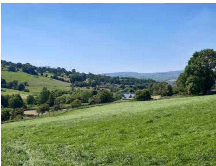
Walking near Foulridge: a new view of Pendle

We decided that w/b 22 nd , 29 th June and 6 th July would focus on meeting participants 1 to 1 or in small groups (no more than 4 including staff) for walks local to where participants live. This provided the PEN participant a chance to catch up with someone that they haven't seen for a while, and to have a conversation with someone different (other than family/friends who they may have been living with/looking after). Many participants have continued to get out walking locally throughout lockdown, however for those that haven't we were able to offer them the support to go on a short local walk.