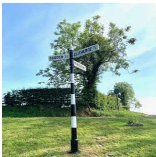
Fingerpost at Pendleton before and after renovation work, supported by the Pendle Hill Fund

We have also ring fenced £6000 from the Pendle Hill Fund specifically for improvement and repairs to PROW furniture. This has been identified due to the recent increase in footfall locally, and some routes