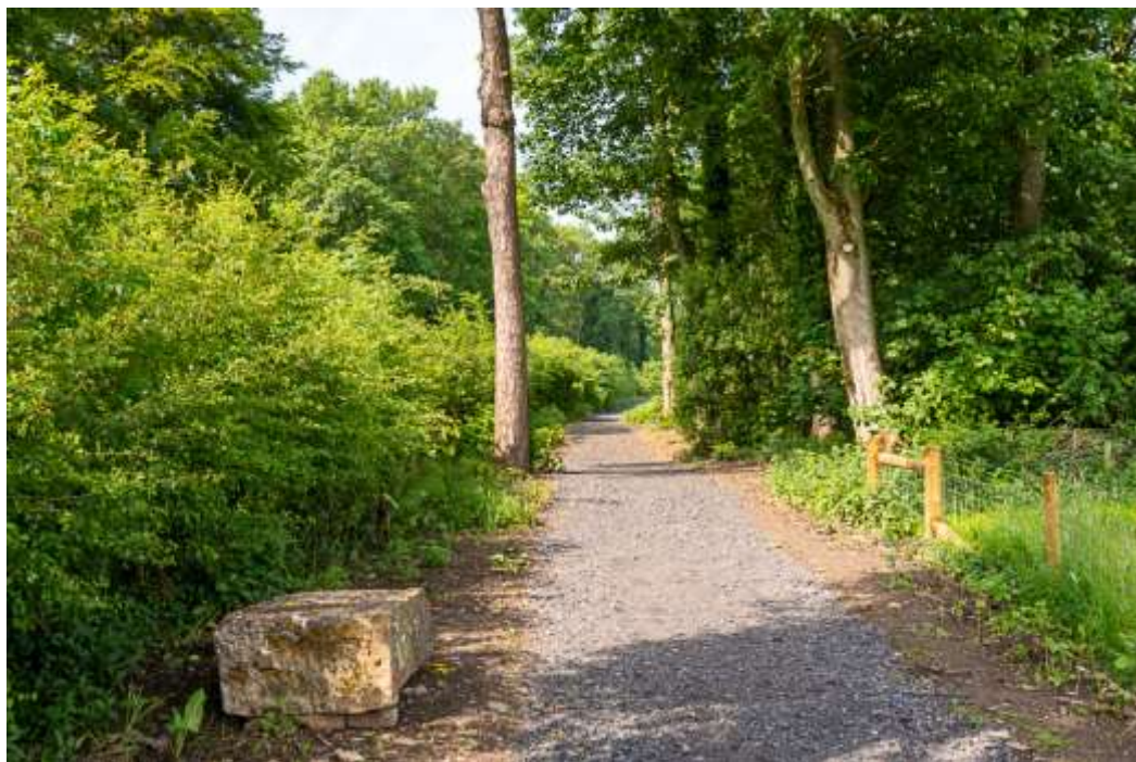
The completed bridleway, showing the newly planted hedge and seat for walkers and riders

The Downham to Chatburn Bridleway is now finished and complete with all conditions discharged from the planning application. Not a bad effort when staff have been working from home and contractors have had to work in a different way with the challenges of limited materials. Good job we have forward thinking contractors who were well prepared before lock down.