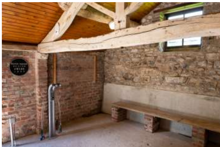
A visitor admires the new interpretation and bench, and the extra window with bike pump and maintenance kit

Work on the path at Mearley Moor was stopped at the start of the pandemic. We hope that it will be finished in September when the contractors can get back onto the hill after the bird nesting season.