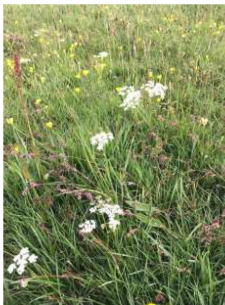
Meadow surveying at the foot of Pendle, and the increasing diversity now found at Cockshotts

We have been working on a meadow restoration project at Cockshotts Farm in Sabden since the summer of 2018. Since then we have made two seed additions as well as planting plug plants in early 2019. The meadow is progressing well, and will be re-surveyed in Q2.