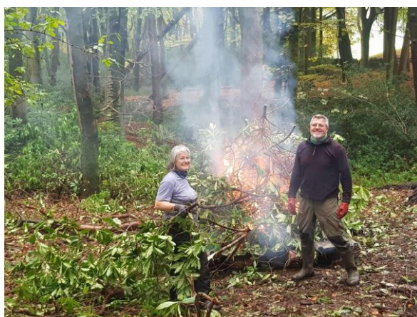
The rhododendron infested Badger Plantation before and during removal work