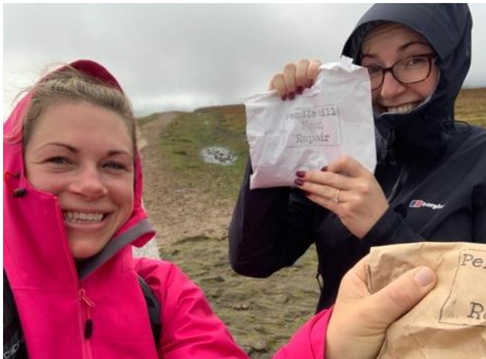
Walkers carrying seed to the summit for sowing into bare peat

A Summit volunteer day was held in early October to add more grass seed on the east side of the cart track up by the trig point with volunteers doing the seeding, and also talking with visitors bringing bags of seed up from Kerry at the bottom of the steps.