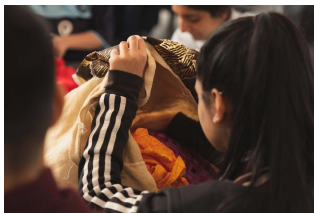
Banner making workshop at the Garage