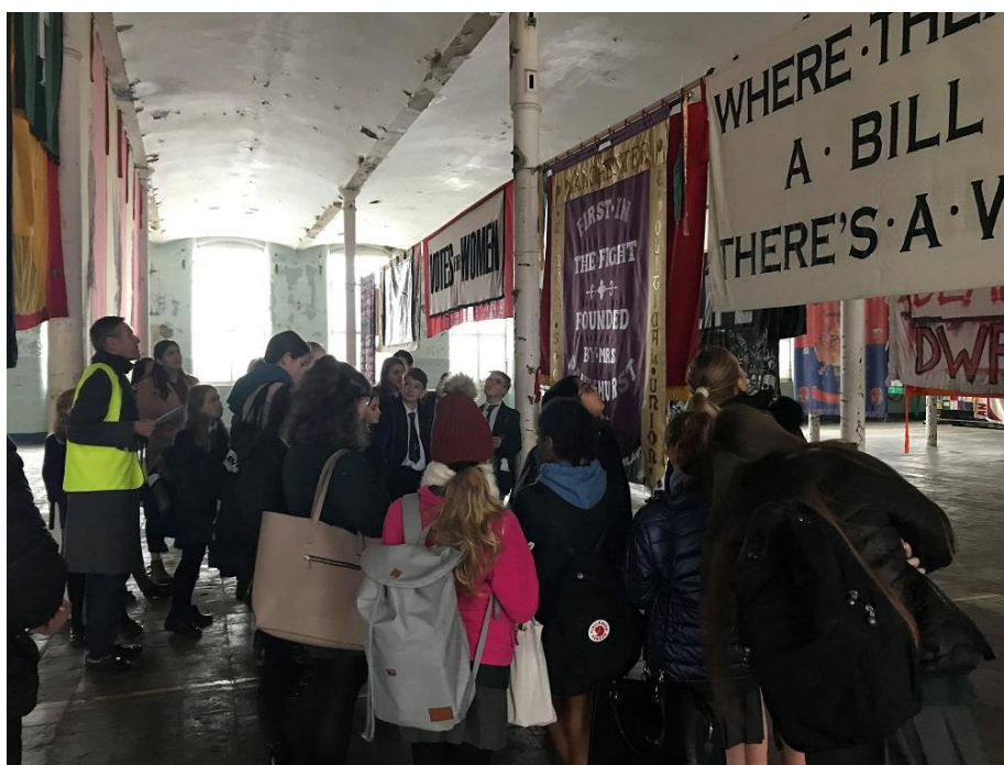
Ribblesdale school view the Banner Culture exhibition