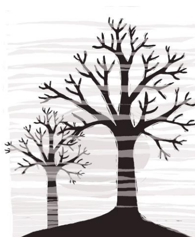
Haze first covers the sky

4 th February: Misty skies (both illustrations by Cath Ford)