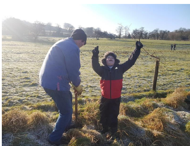
Tree planting at Downham Beck