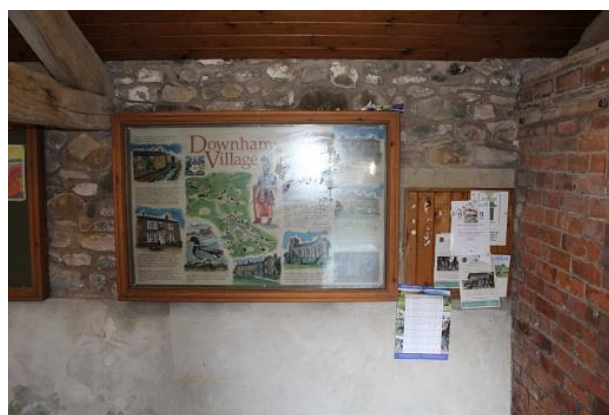
Downham Information Barn before works, January 2020