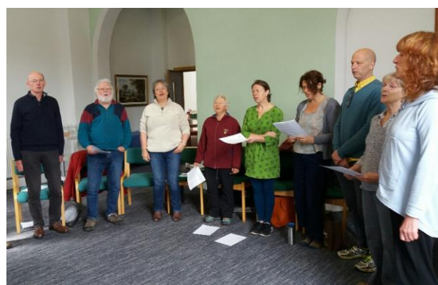
Members of the Rise Up Community project visit Pendle Hill; and Pendle Hill Song Fellowship in full song

The panel suggested, and now plans have been put in place, for a new small grants fund to open on 13th January 2020. This will be open for projects up to £500, will run continuously until the money runs out and will be decided by the Community Engagement Officer (with help where needed), rather than going to the Grants Panel. The Grants Panel will receive an update every 6 months.