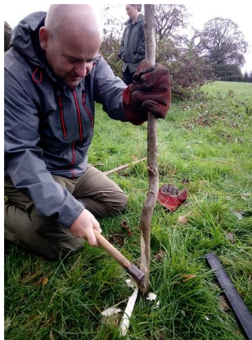
The Pendleside Farm wall: work in progress, December 2019,

County Cllr Turner joining the PEN group hedging on World Mental Health Day, October 2019