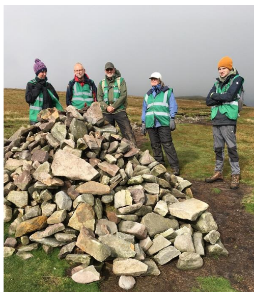
Volunteers carrying out woodland management and checking on works at the summit