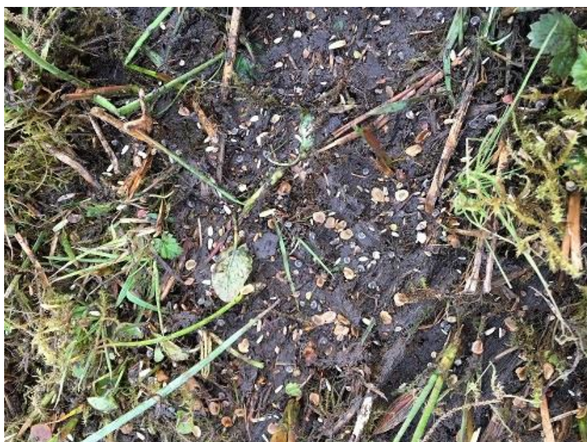
Raking the meadow at Clarion House after cutting, and new seed sown into the meadow at Barley