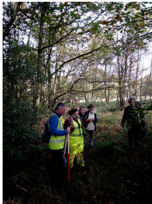
Family archaeology event, and woodland archaeology survey training at Hagg Wood

NAA delivered a woodland survey training session in Hagg Wood, an ancient woodland owned by the Woodland Trust. Some volunteers then returned to continue surveying the woodland.