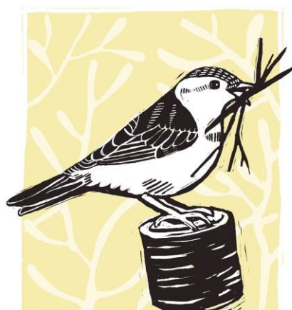
The sparrow builds her nest