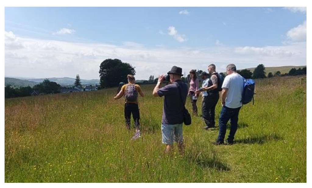
The PEN group enjoying the Pendle Meadow at Cockshutts Farm

Monday afternoon walks have also continued, and these tend to be still well attended by regular, as well as new participants. We continue to utilise areas around the Landscape Partnership, as well as within, for these walks to introduce people to local walks that they might feel comfortable doing again by themselves or with friends/family.