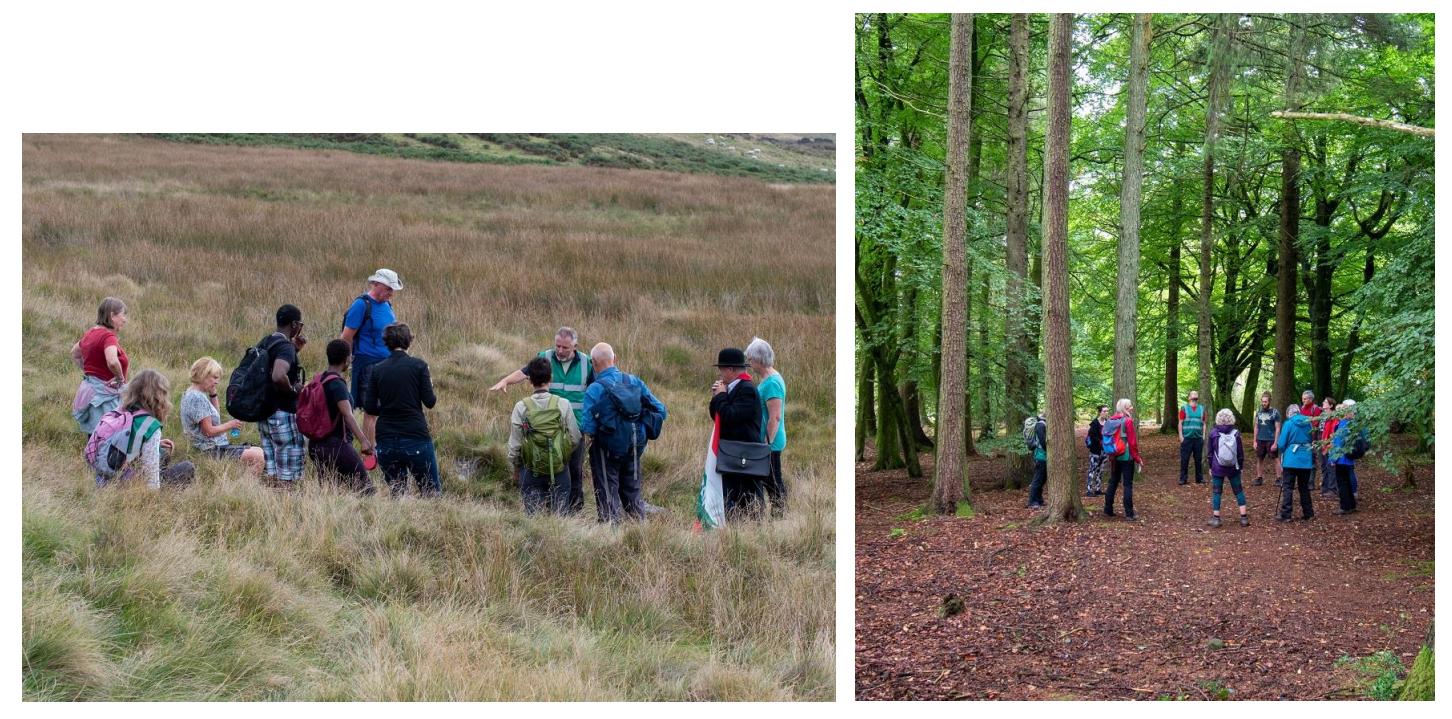
Walks during the Festival: Pendle Radical's led 'Chartists Walk' (L) and a Mindfulness Well-Being walk (R)

'I always find the events organised by Pendle Hill partnership imaginative and well organised. I look forward to attending them through the seasons.'