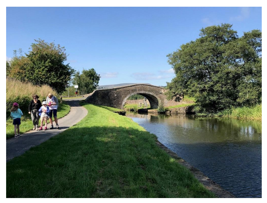
Family Landscape Walk along the canal at Barrowford

During the school summer holidays, we delivered 10 Family Nature events across Pendle and the Ribble Valley. All events were well attended and appreciated after a year's pause due to Covid. The themes ranged from minibeast hunting with Ribble Rivers Trust, to archaeology sessions, plus landscape walks and learning more about traditional boundaries using DSWA resources.