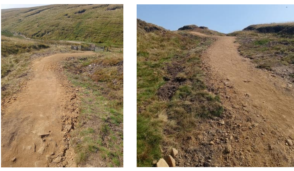
The track after resilience work, showing the repaired surface and profile

The track to Ogden Clough before repairs – showing the deep washout area