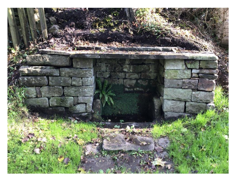
The restored historic well at Wiswell

We have also closed the delegated small grants scheme . This is currently supporting the Ribble Valley Archaeology Group, and also Wiswell Parish Council, who have completed a small project which involved the restoration of a local historic well and engaging the village community in the heritage information.