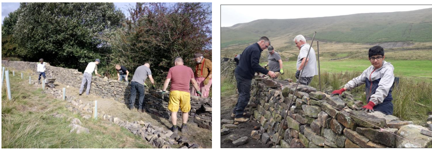
Volunteers at Martholme Greenway (L), and participants on the level 1 course at Pendleside (R)

https://www.youtube.com/channel/UCATXMlsMsExn4wqpn4Dsr6Q/videos