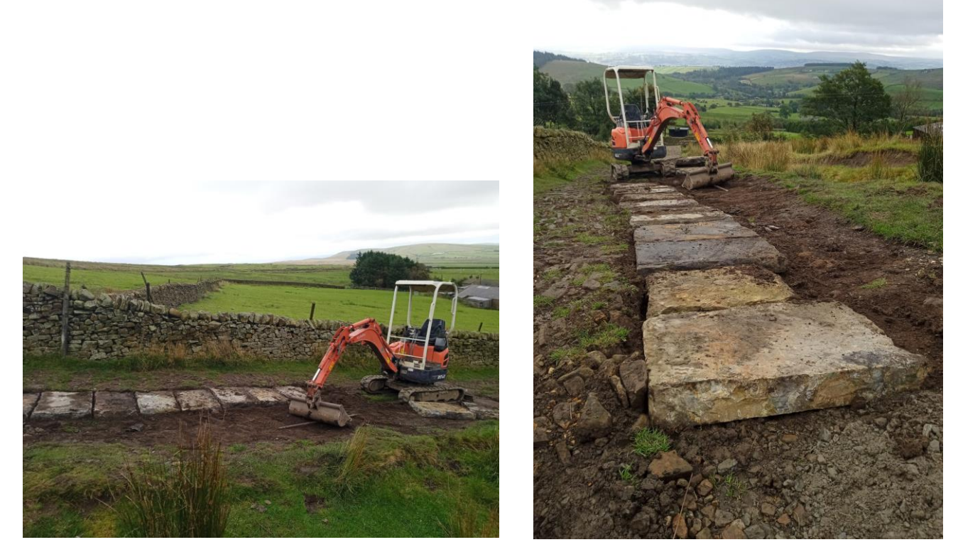
The new flag path being installed at the foot of Pendle, aiming to create a more resilient path for walkers

Again, by the time this report is submitted the flagged path at Pendleside will have been completed. Delays have been because of delivery issues, supply issues, not to mention a long-distance haulage.