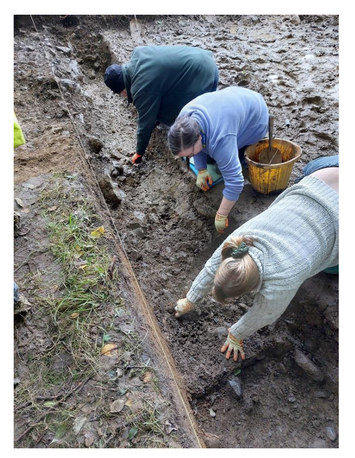
Volunteers helping excavate the trench to expose a Roman Road

The excavation involved 4 days of volunteer activity, plus 2 group visits to site. The volunteers were able to assist with the excavation and learn more about the process from the NAA professionals. We also delivered 2 days of volunteer activity before the excavation, to survey a section further along the Roman road.