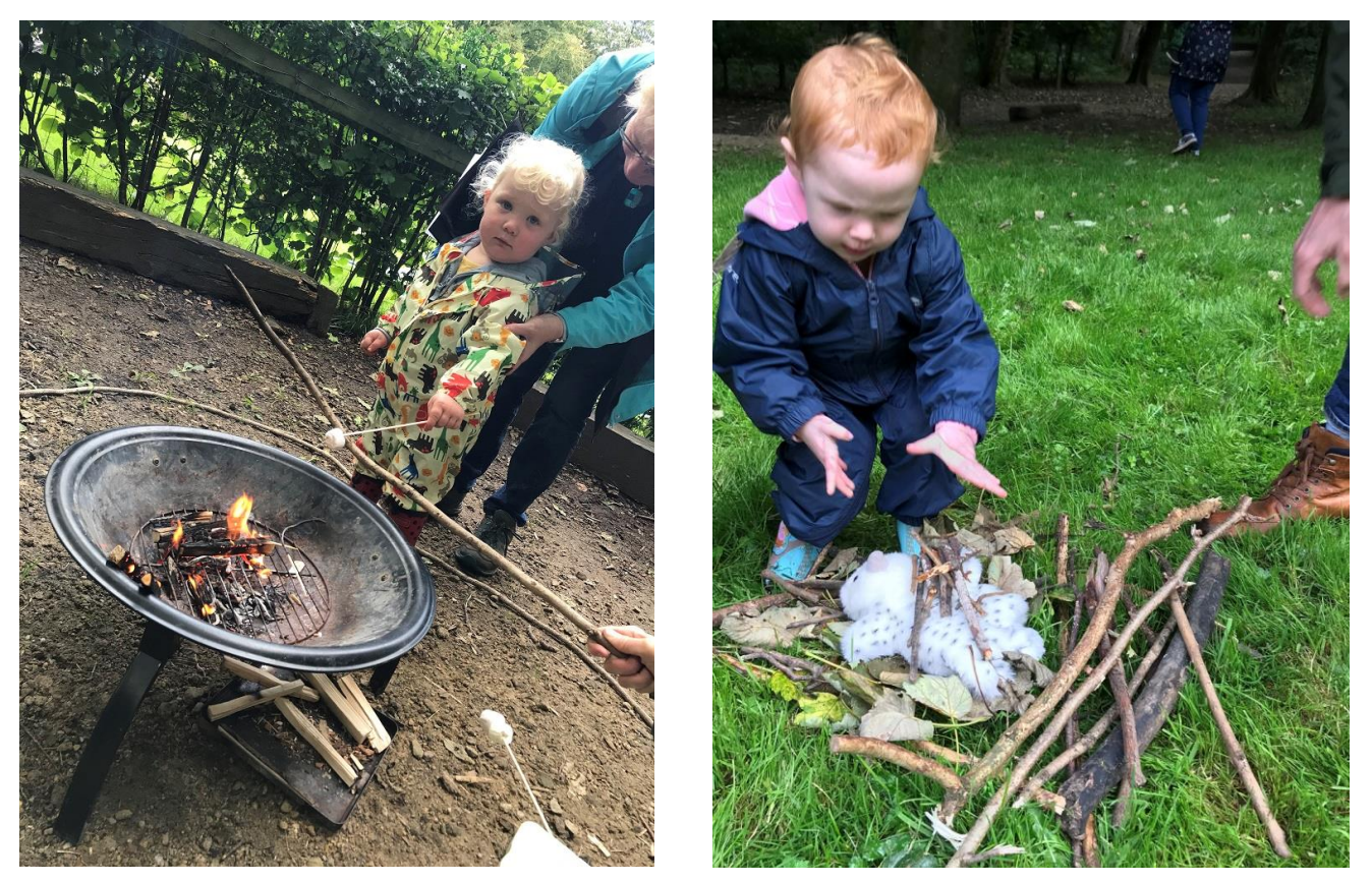
Little Saplings participants toasting marshmallows and building birds nests

Little Saplings mini sessions continued until the summer holidays, with all the sessions being fully booked. Then, on 8th September, Little Saplings returned in its original 1.5 hour format. Advertisement consisted of the three information films, a 2021 poster and a press release. Sessions are now fully booked into October. Parents voiced how thankful they were to have this fully funded opportunity and that it had been much missed. Volunteers have enjoyed being back working with the toddlers and their parents/carers, especially learning how to light fire and deliver sessions using the Forest school ethos.