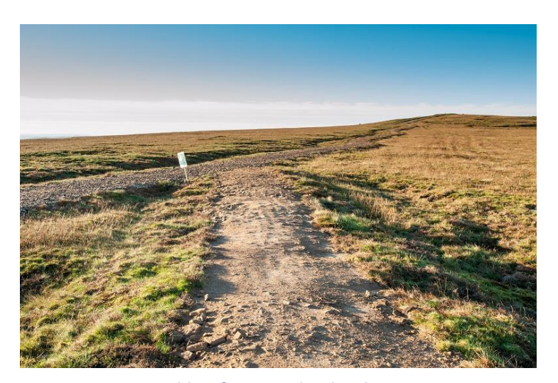
New Summit subsoil paths

2600m of footpaths on Pendle Hill have been restored by contractors Conservefor over the summer. This has included subsoil paths linking the trig point to the two main paths (cart track and steps); plus major restoration of the badly eroded 'cart track' including water bars and a zig zag path which required top dressing to bind the surface. A volunteer photographer has undertaken 50 days of monitoring work on the site to deliver before and after photographs of the work undertaken; and Catapult films are producing a short film to document the footpath and peatland restoration works.