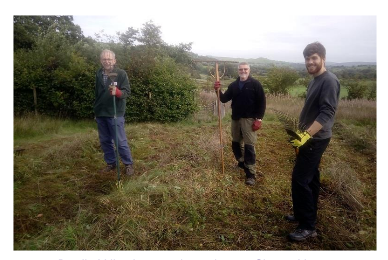
Pendle Hill volunteers haymaking at Clarion House

The links with the Pendle Hill Farmers Network continues to grow. This quarter we have worked on the following: