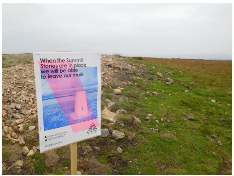
Summit signs In-Situ

https://www.instagram.com/insitu_pendle/ view The Gatherings