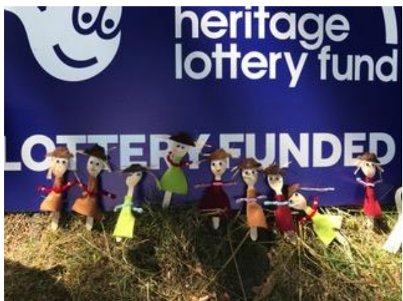
Summer Holiday family learning activity