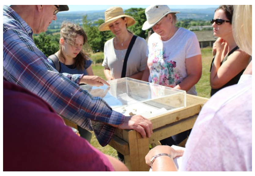
Malkin Tower community day