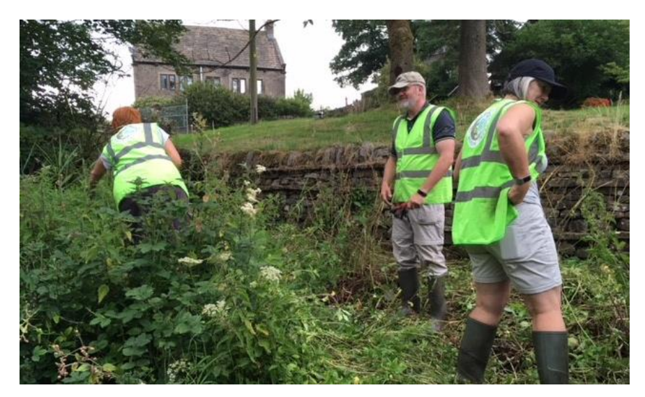
Ribble Rivers Trust volunteers removing Himalayan balsam at Barley