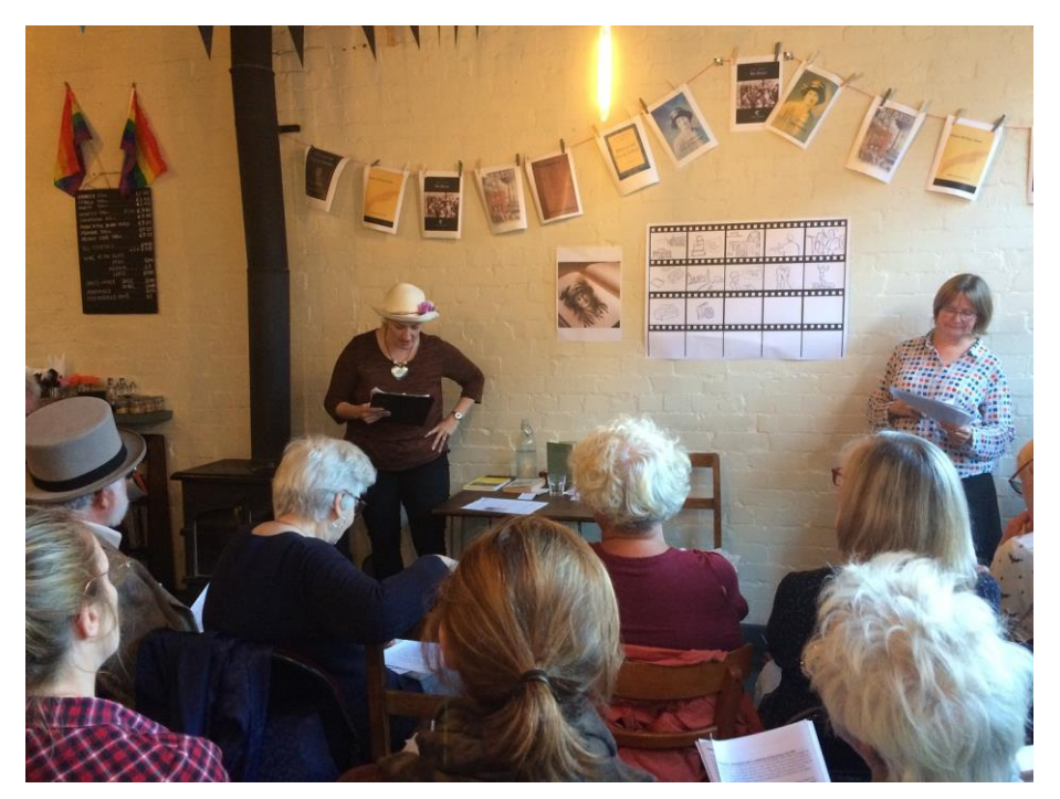
Pendle Radicals at Burnley Literature Festival: Searching for a Factory Girl

The focus during this quarter has been on building up and consolidating our core group of volunteer researchers. We are delighted with progress: two research and discussion groups have been held, plus a research visit to Lancashire Archives, each session attracting 6-8 volunteers. The volunteers have developed the first detailed enquiry, into writer Ethel Carnie Holdsworth, and two public events have been held in July and September, the second as part of Burnley Literature Festival attracting 30 people. Participants are initiating research into topics including Sydney Silverman MP, the 'radical rambler' Tom Stephenson, the force behind the creation of the Pennine Way, Selina Cooper, and the tradition of protest banners.