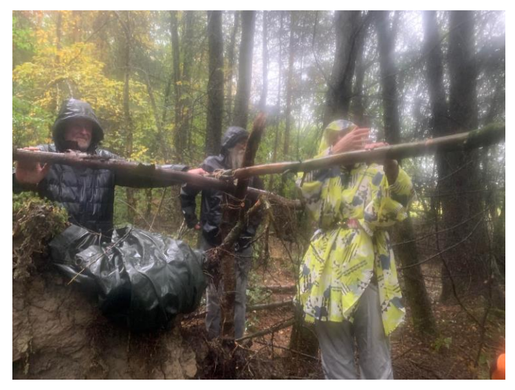
PEN getting wet den building

• Plans to continue to run twice monthly PEN sessions October – December