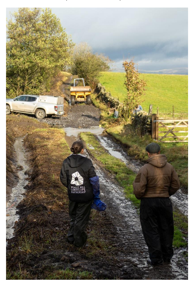
Checking on the repairs to Coalpit lane