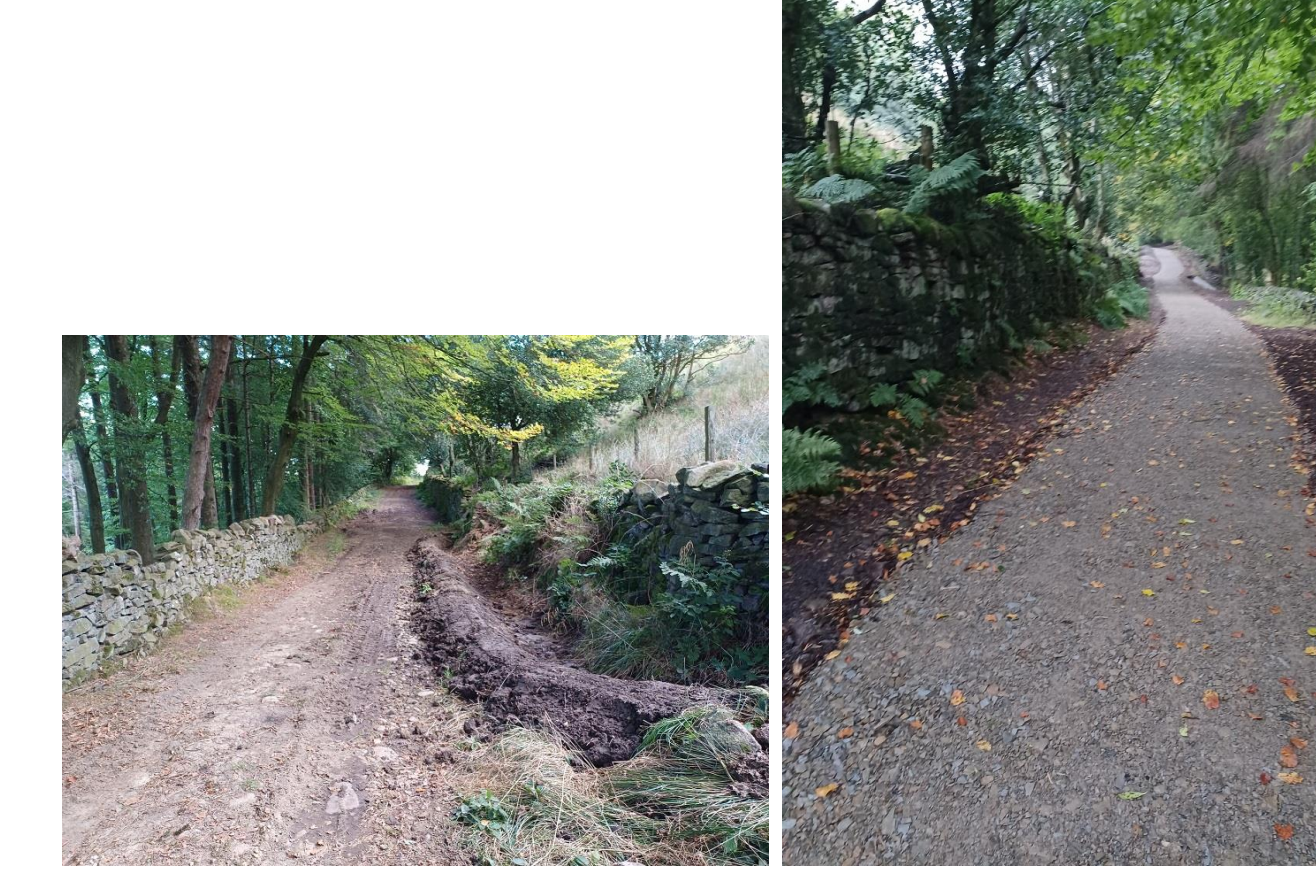
New drainage on Heys Lane installed, and the lane resurfaced