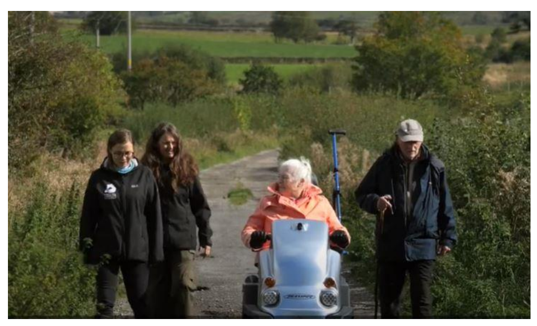
Sabden Tramper trail test drive – Sept 2022