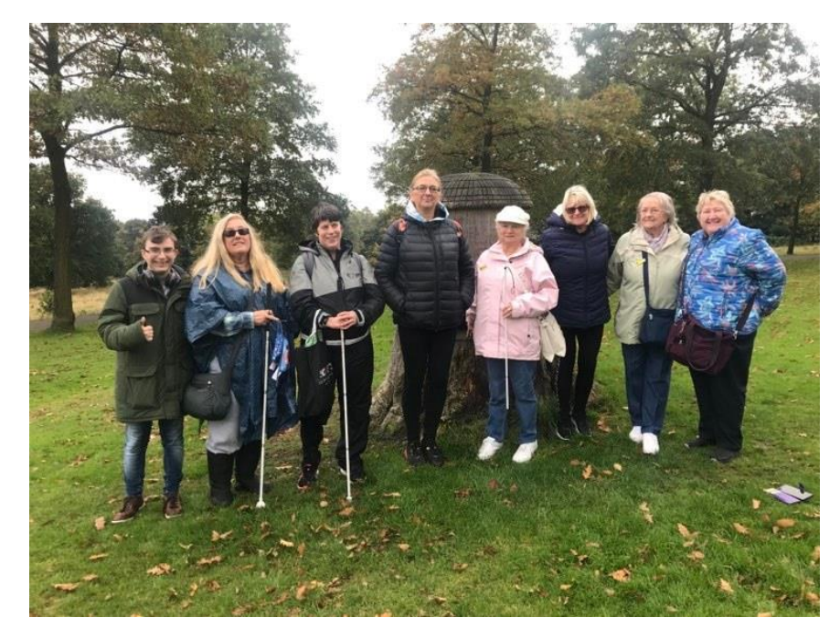
Colne visually impaired group walk in October