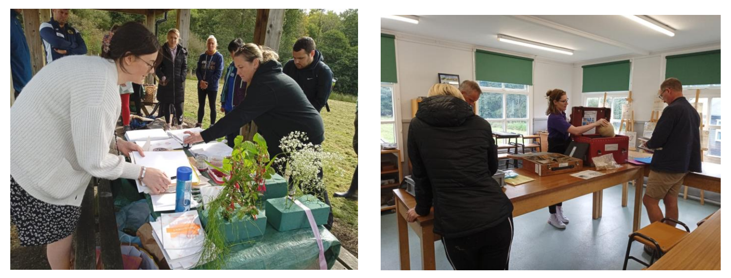
Teachers having a go at outdoor learning activity at the conference

• Tramper volunteers to be recruited and trained in Sabden