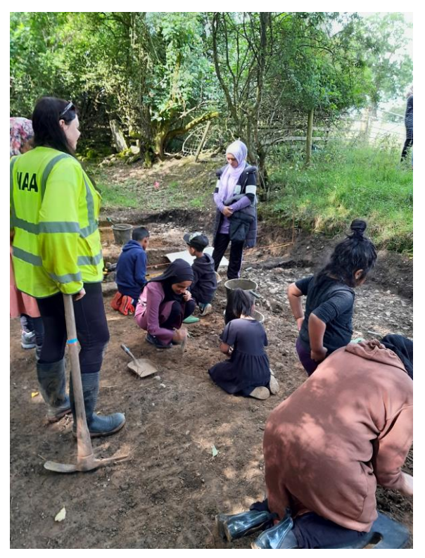
Volunteer dig at Roman Road site (left), and visit from the DEEN centre (right) Nick o Pendle, Prehistoric mysteries walk (below)