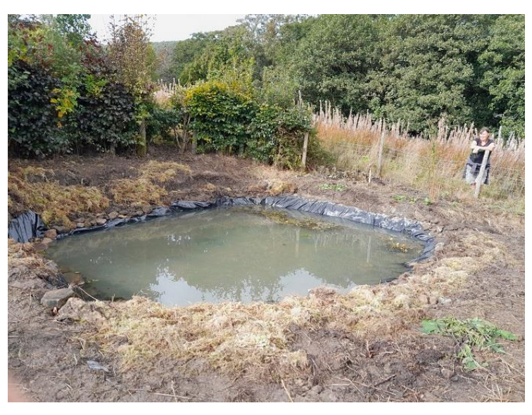
The completed restoration of the pond at Clarion House