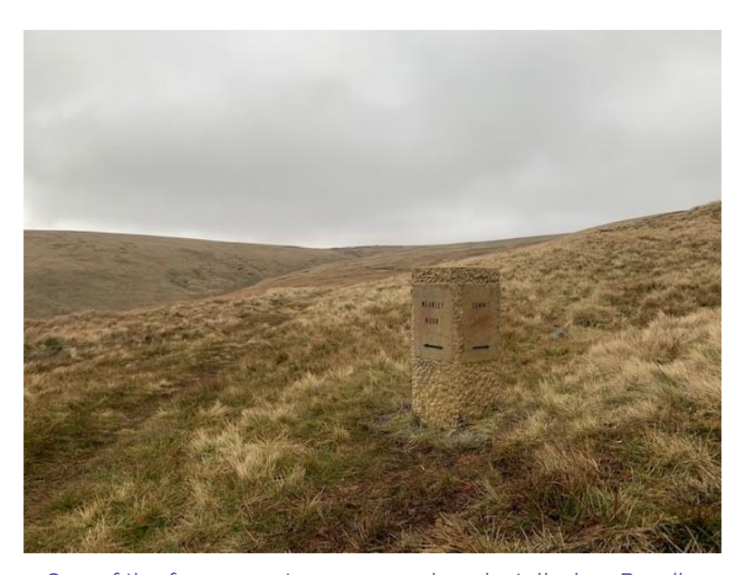
One of the four new stone waymarkers installed on Pendle

However, we have had some fantastic work done by Field and Fell who have installed the new stone way marker posts at 4 new locations on Pendle Hill. This will continue to aid walkers when visibility and mobile reception are both hard to find.