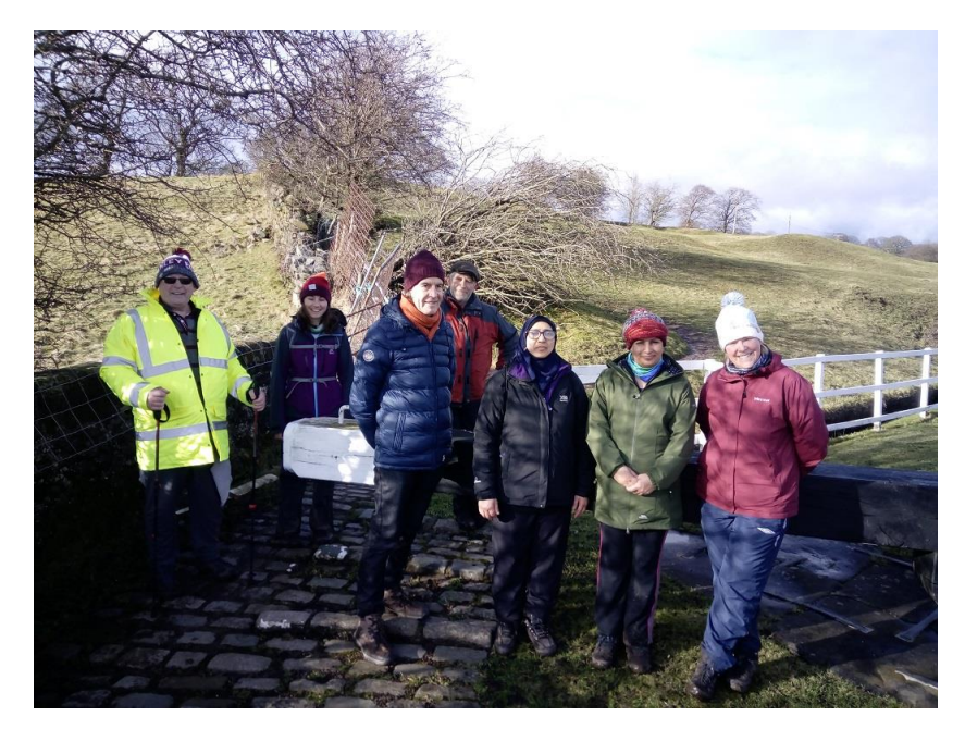
Participants on one of our Monday PEN Walks near to Barrowford Locks

We have delivered a further 7 walks on a Monday afternoon – on and around the Landscape Partnership area. We have also delivered 4 more winter activity sessions. These have included a session making bird boxes at Offshoots (Burnley), a trip to Clitheroe Castle, a Treasure Trail around Chatburn and another mindfulness/forest bathing walk delivered by Stacey Mckenna-Seed.