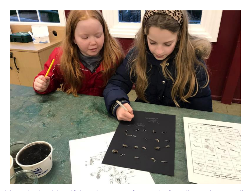
Girls enjoying identifying the prey of an owl after dissecting a pellet

During February half term, we ran an Owl Pellet Dissection event as part of the Forest of Bowland AONB's Dark Skies week at Whitehough Outdoor Centre. 21 Adults and 32 children learnt about owls, what they eat and how they produce a pellet. A mum commented, "it was honestly one of the best activities I've done with my boys to date. I'm on the hunt for an owl nesting tree so I can find my own pellets! Thanks so much, they had much to talk about at school today."