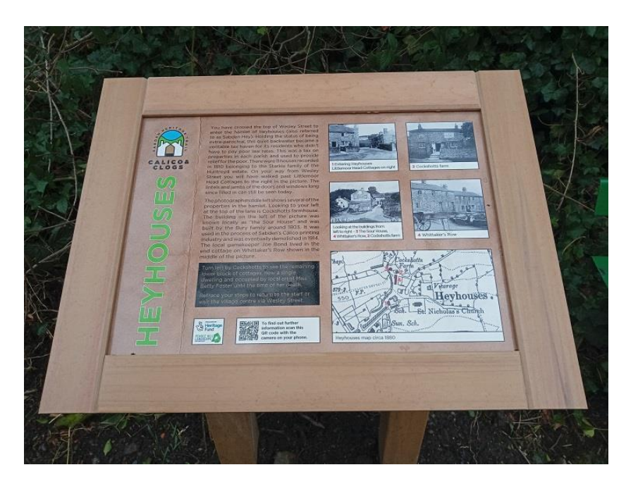
An information panel from the Calico & Clogs Trail in Sabden

• The Calico and Clogs heritage trail in Sabden is now in place, and the Parish Council are planning for a launch event of the trail. They have now made an interim claim, but they are planning some more developments on the trail before they complete the project grant <a href="https://www.sabdenparish.org.uk/heritage-trail.php">https://www.sabdenparish.org.uk/heritage-trail.php</a>