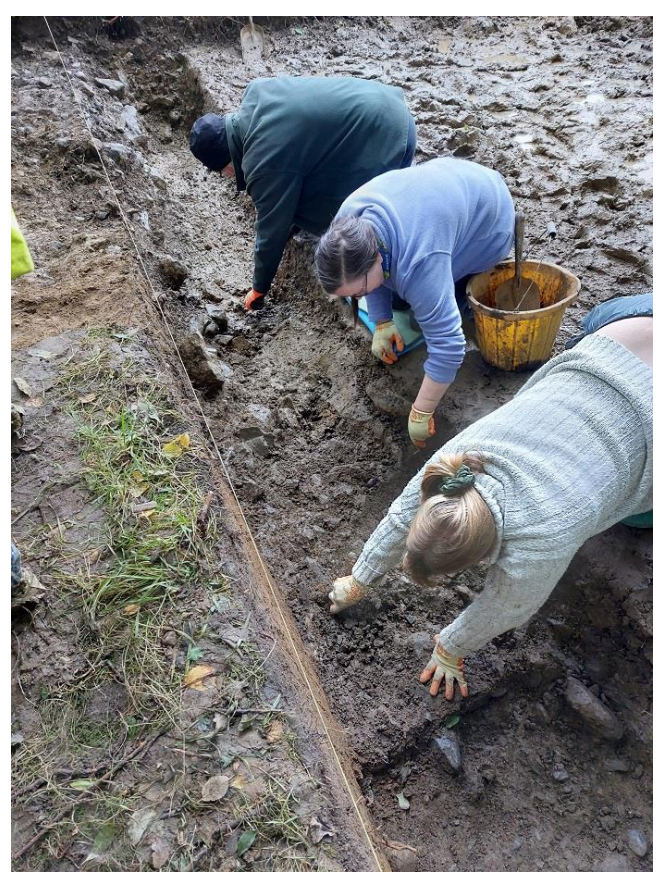
Volunteers helping excavate the trench to expose a Roman Road

The excavation involved 4 days of volunteer activity, plus 2 group visits to site. The volunteers were able to assist with the excavation and learn more about the process from the NAA professionals. We also delivered 2 days of volunteer activity before the excavation, to survey a section further along the Roman road.