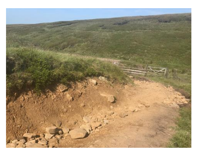
The track to Ogden Clough before repairs - showing the deep washout area

Resilience work on paths on the hill itself is ongoing, with some work complete and some about to start. Field and Fell have completed the reprofiling of the badly eroded path heading toward Ogden Clough , and after a short break whilst waiting for materials to be delivered, the kissing gate to replace the badly rotten ladder style will be installed by the time this report is submitted.