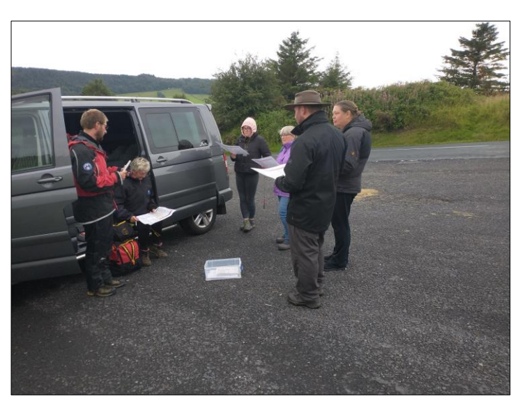
Training for volunteers has included Outdoor First Aid and Navigation Skills