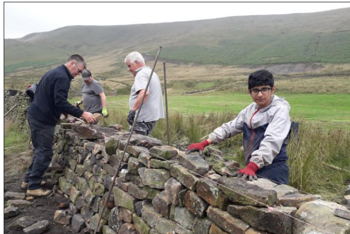
Volunteers at Martholme Greenway (L), and participants on the level 1 course at Pendleside (R)