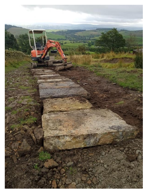
The new flag path being installed at the foot of Pendle, aiming to create a more resilient path for walkers

The plans for the refurbishment of Spring Wood Information Centre are still ongoing. Designs have been finalised with the project group from Lancashire County Council ready to take plans to the planning application stage and tendering to follow. A date for construction is yet to be set, but it is hoped to be decided in the coming weeks. See additional report to be submitted.