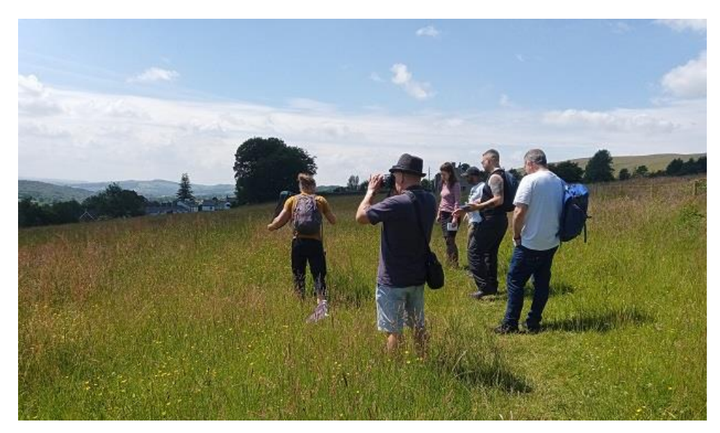
The PEN group enjoying the Pendle Meadow at Cockshutts Farm

Monday afternoon walks have also continued, and these tend to be still well attended by regular, as well as new participants. We continue to utilise areas around the Landscape Partnership, as well as within, for these walks to introduce people to local walks that they might feel comfortable doing again by themselves or with friends/family.