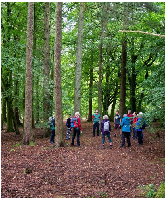
Walks during the Festival: Pendle Radical's led 'Chartists Walk' (L) and a Mindfulness Well-Being walk (R)