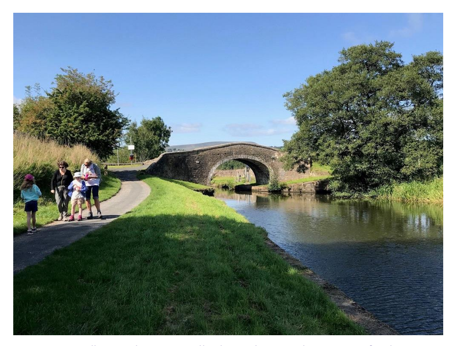
Family Landscape Walk along the canal at Barrowford

During the school summer holidays, we delivered 10 Family Nature events across Pendle and the Ribble Valley. All events were well attended and appreciated after a year's pause due to Covid. The themes ranged from minibeast hunting with Ribble Rivers Trust, to archaeology sessions, plus landscape walks and learning more about traditional boundaries using DSWA resources.