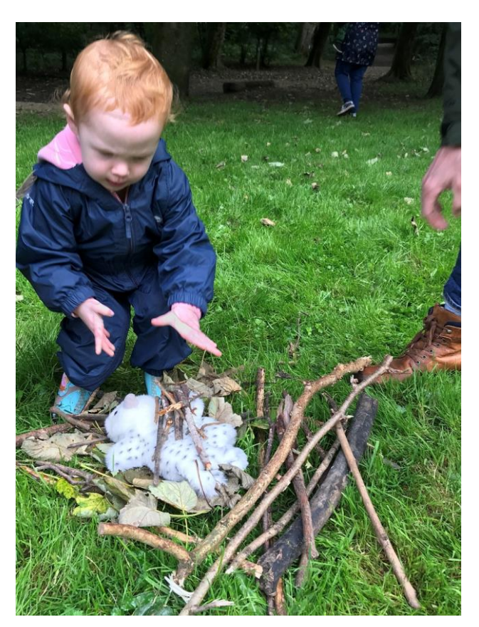
Little Saplings participants toasting marshmallows and building birds nests