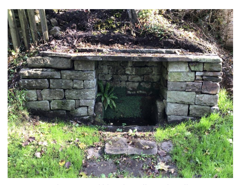
The restored historic well at Wiswell

We have also closed the delegated small grants scheme . This is currently supporting the Ribble Valley Archaeology Group, and also Wiswell Parish Council, who have completed a small project which involved the restoration of a local historic well and engaging the village community in the heritage information.