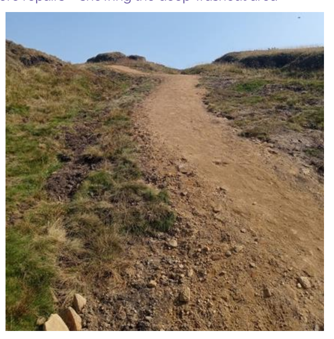
The track after resilience work, showing the repaired surface and profile