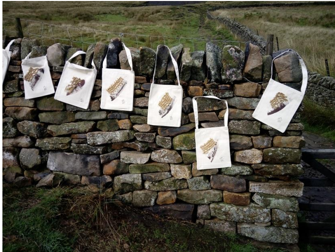
Sewing the tote peat bags (L) ready for the Sowing in Time event on the hill (R)

Last quarter, we published Reconnect and began distributing it across Pendle. Reconnect offers an inclusive opportunity for people, with or without access to personal digital devices and internet, to get involved with our programme and to be creative. A digitised extract now exists on the PHLP website, alongside YouTube tutorials that demonstrate three of the eight activities.