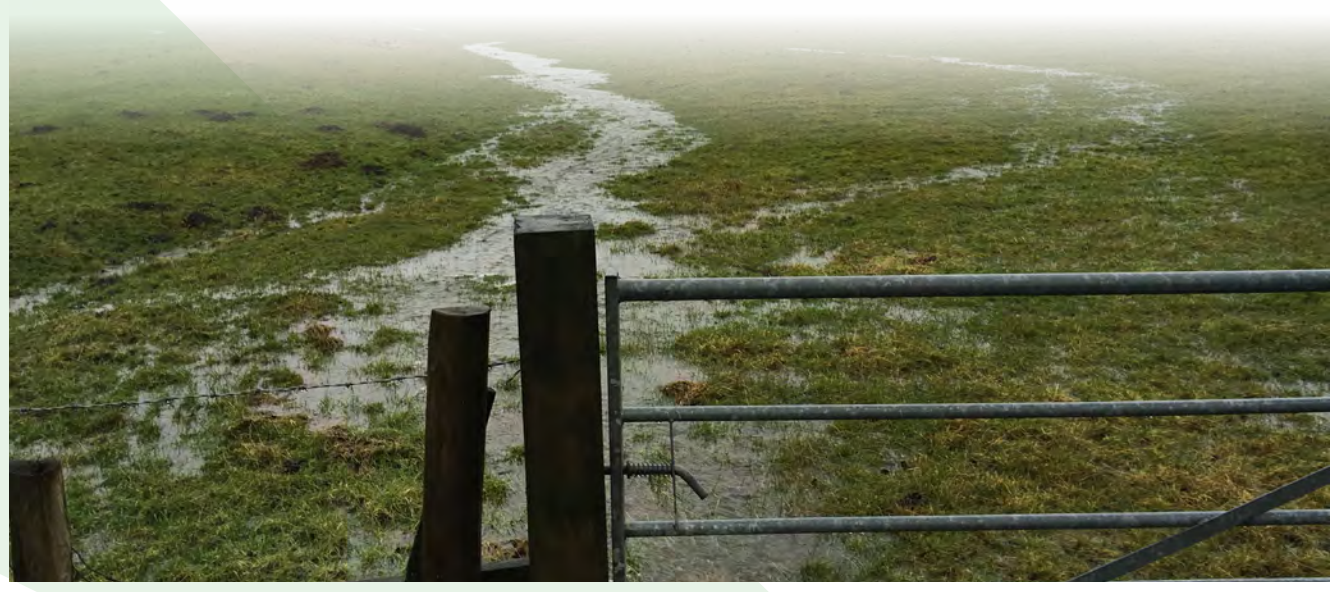
Overland flow