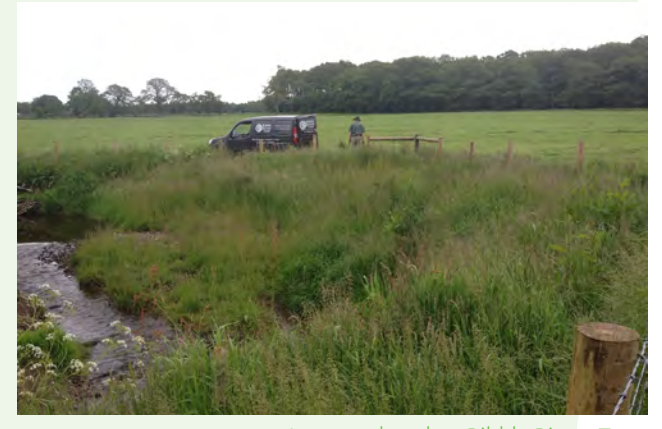
Leagram brook

In-field buffer strips, as their name implies, are found adjacent to field boundaries and across fields. They can reduce overland flow impacting roads and neighbouring properties.