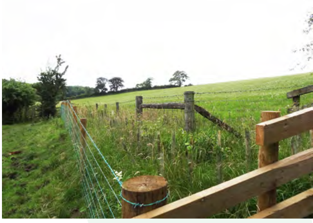
Laneside Farm West Bradford