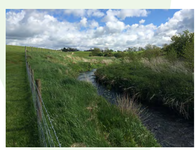
Stock Beck