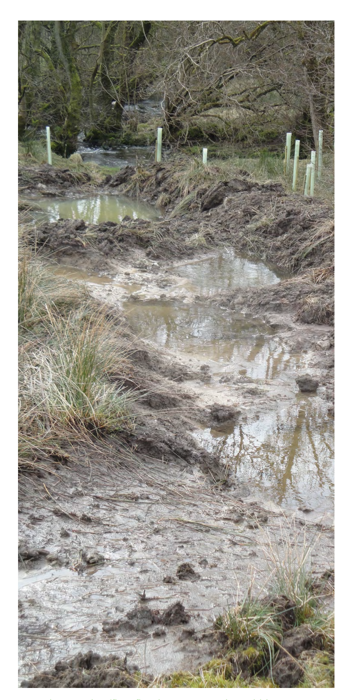
Agden Brook Offline flood storage pond