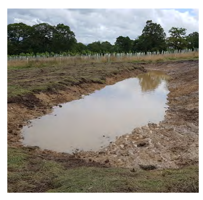
Detention Basin (Lower Knotts)

The reprofiling of the land can be designed so that the retention area is normally dry and can remain productive, as well as providing an opportunity for reclaiming soil and nutrients. Alternatively, levels can be set to encourage the development of wetland habitat within the flood storage area by permanently retaining some water.