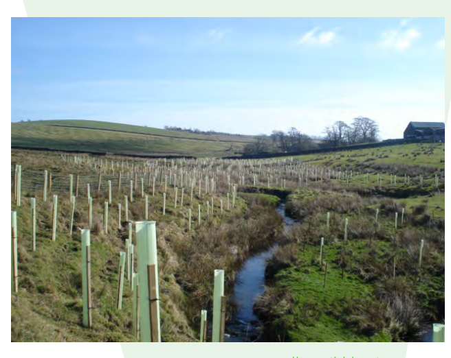
Harrop Hall

There is growing interest in the potential to use woodland measures to help reduce flood risk. The Forestry Commission (FC) has been directly involved in a number of trials and demonstration projects – for example, at Pickering. These projects have shown that looking after existing native woodlands and plantations, and targeting certain areas for tree planting, will significantly slow overland flow of water and reduce river bank erosion within that area.