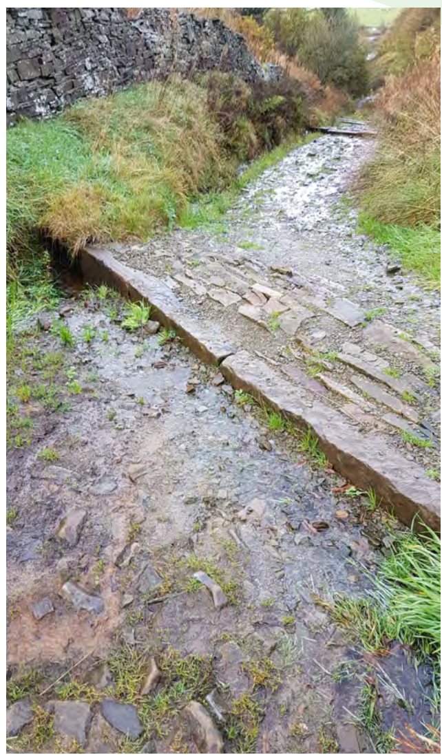
Cross drain

Tracks provide a significant transport pathway for water and sediment. This creates problems with erosion of the track and deposition of sediment on farmland, roads or watercourses. Tracks are costly to repair, but are essential to the farm. A cross drain is a system to move water across a path or route and can be used to collect runoff from a vulnerable area.