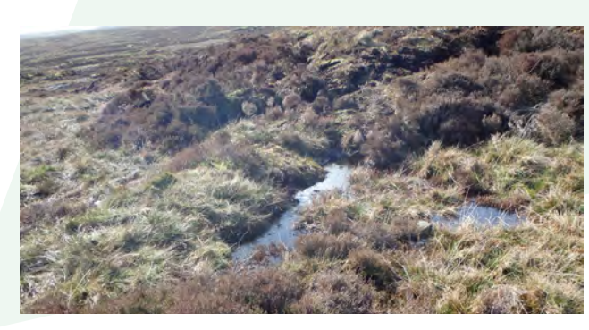
Abbeystead peat dams