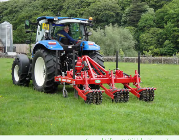
Sward Lifter