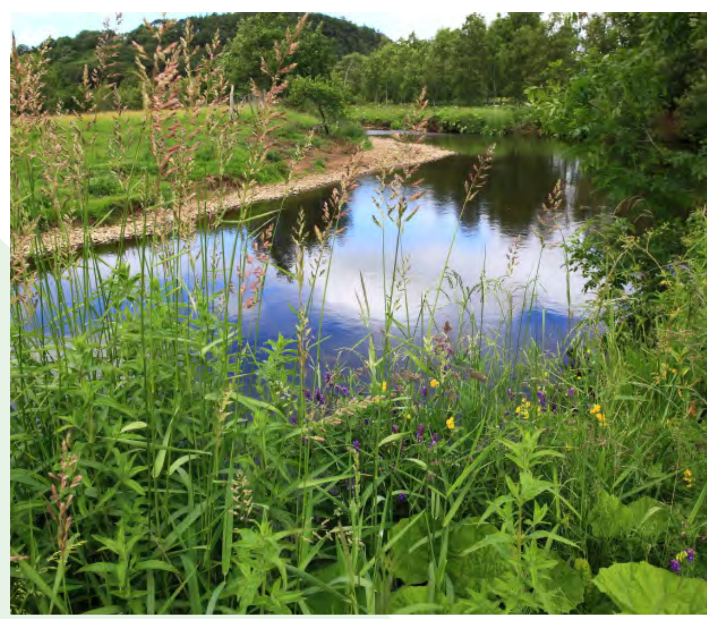
River Hodder at Newton-in-Bowland

River and floodplain restoration encompasses a range of different techniques which are often used in conjunction. They include restoring meanders and removal or setting back of flood banks, often together with habitat creation such as wetlands, habitat for breeding and wintering waders, and wet woodland.