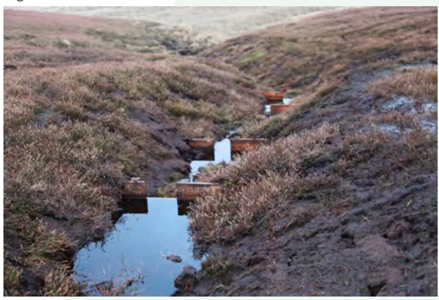
Anglezarke wooden dams and reprofiling

Blocking of grips and moorland drainage channels converts drained moorland back to peatlands. Restoration of wet moorland protects the peat (a carbon sink) and reduces peat and soil erosion, which contributes to discoloured waters and a high sediment load in rivers.