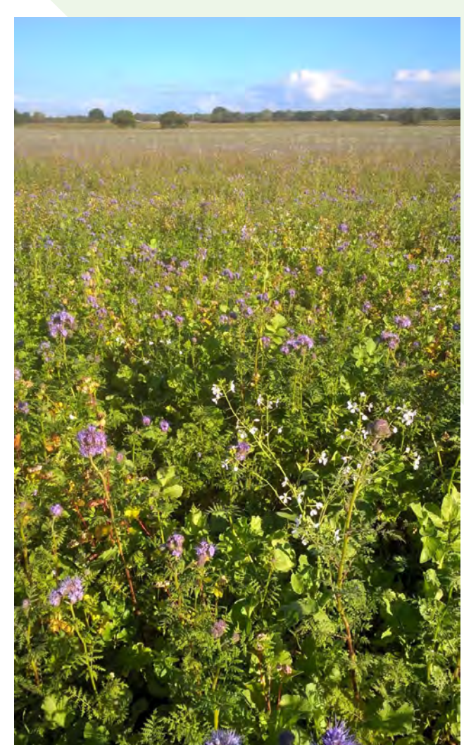
Phacelia cover crop

Agriculture and Horticulture Development Board (AHDB), 2015