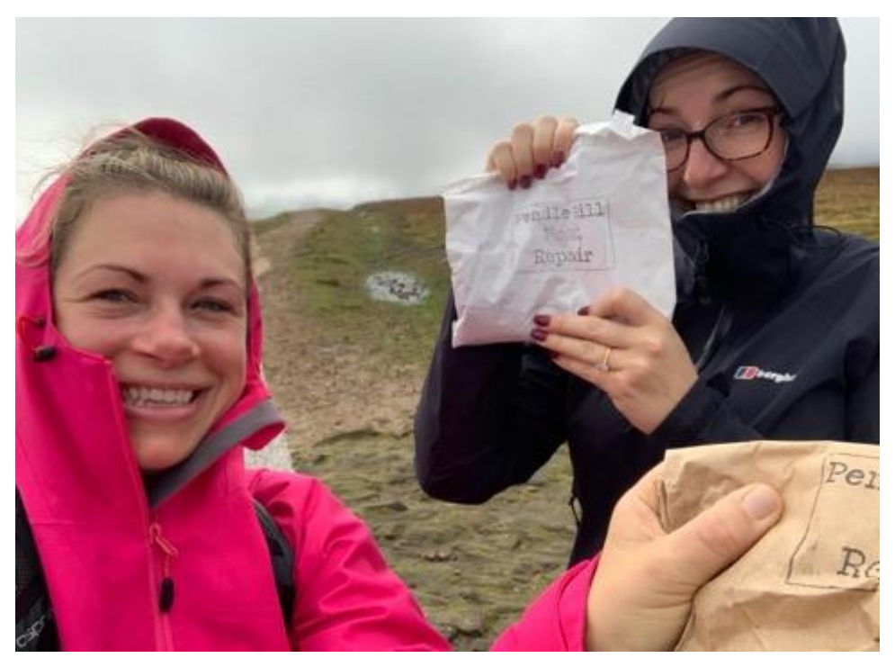
Walkers carrying seed to the summit for sowing into bare peat

A Summit volunteer day was held in early October to add more grass seed on the east side of the cart track up by the trig point with volunteers doing the seeding, and also talking with visitors bringing bags of seed up from Kerry at the bottom of the steps.