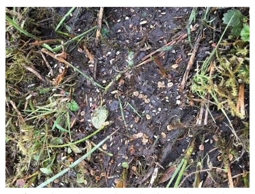
Raking the meadow at Clarion House after cutting, and new seed sown into the meadow at Barley