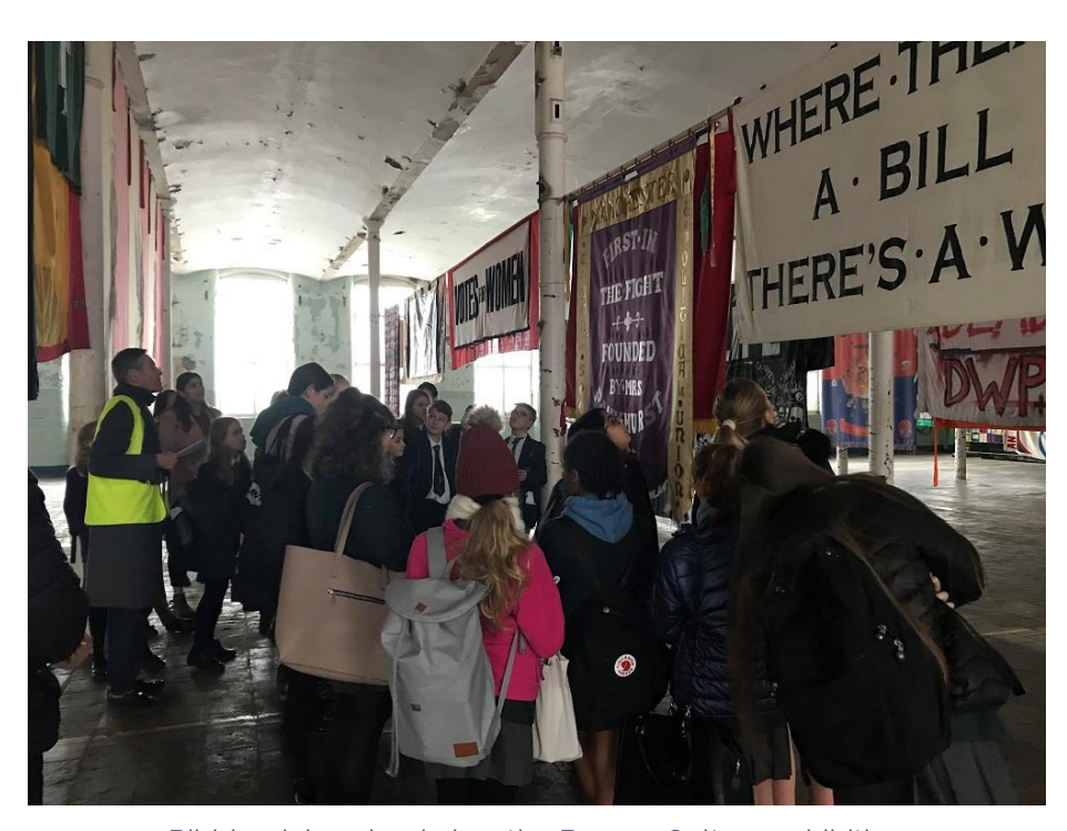
Ribblesdale school view the Banner Culture exhibition

https://www.flickr.com/photos/mpalancashire/albums/72157711780756793 https://vimeo.com/375854161