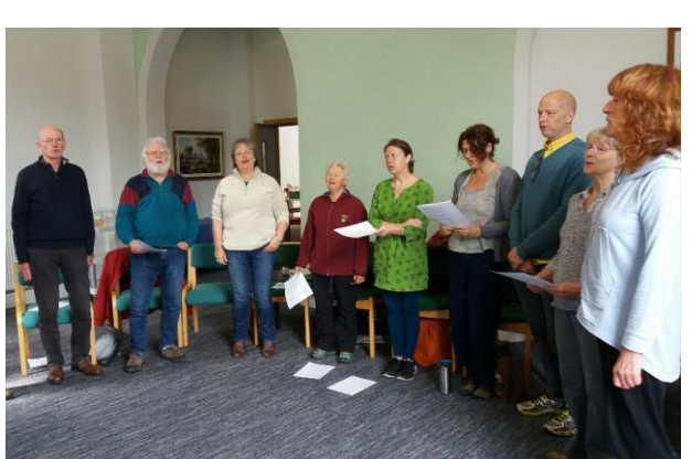
Members of the Rise Up Community project visit Pendle Hill; and Pendle Hill Song Fellowship in full song

The panel suggested, and now plans have been put in place, for a new small grants fund to open on 13th January 2020. This will be open for projects up to £500, will run continuously until the money runs out and will be decided by the Community Engagement Officer (with help where needed), rather than going to the Grants Panel. The Grants Panel will receive an update every 6 months.