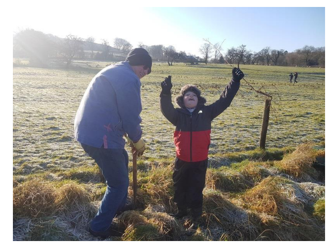
Tree planting at Downham Beck