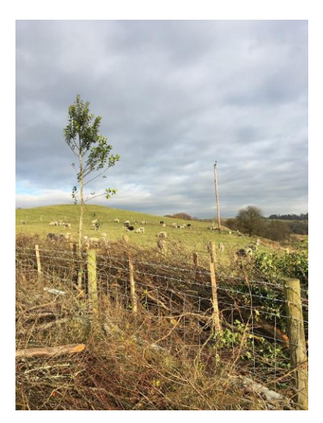
The first hedge to be laid is at High Whittaker farm: Images show it before and after being laid

Landowner's agreements for all agreed capital wall and hedge works are also submitted with this quarter claim.