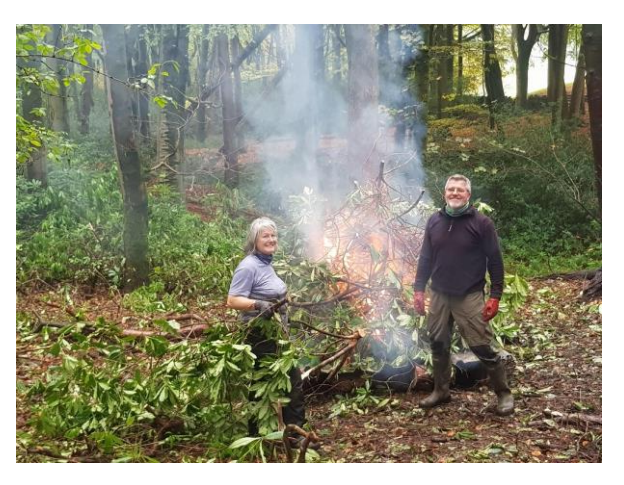
The rhododendron infested Badger Plantation before and during removal work