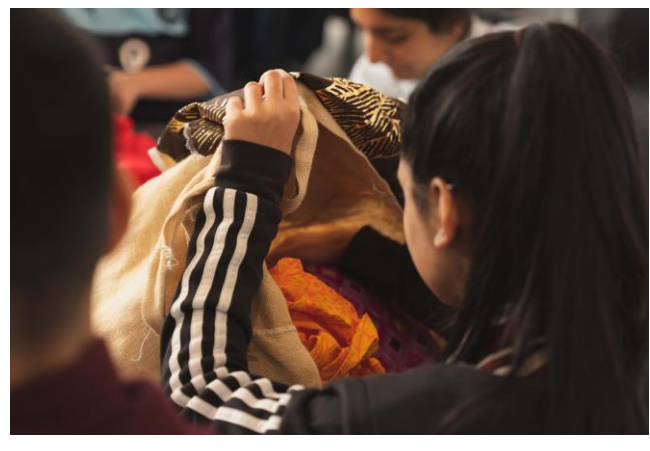
Banner making workshop at the Garage