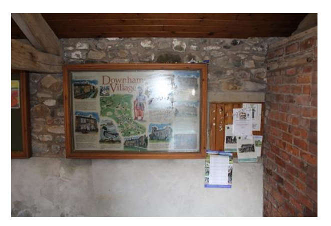
Downham Information Barn before works, January 2020