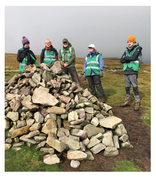
Volunteers carrying out woodland management and checking on works at the summit