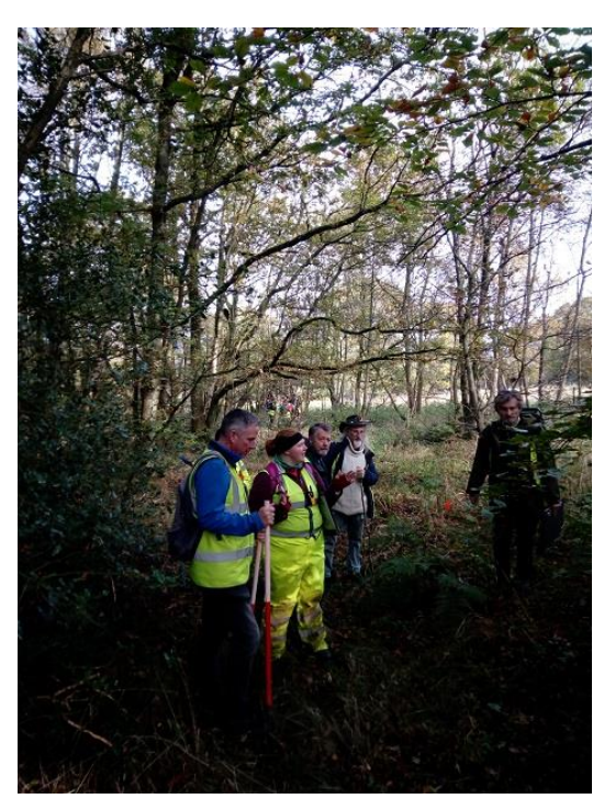
Family archaeology event, and woodland archaeology survey training at Hagg Wood

NAA delivered a woodland survey training session in Hagg Wood, an ancient woodland owned by the Woodland Trust. Some volunteers then returned to continue surveying the woodland.